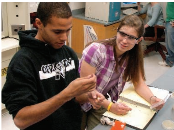
GCAT in the lab. Undergraduates prepare samples and scan microarrays as part of their research at Davidson College.

We have developed the Genome Consortium for Active Teaching (GCAT) (6) to engage undergraduates in genomics experimental design and data analysis. GCAT faculty use DNA microarrays to bring the excitement of interdisciplinary research to students. Students